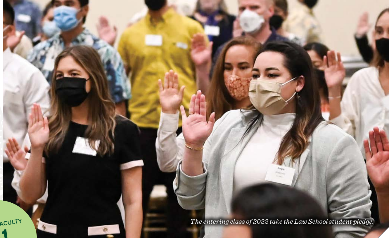
The entering class of 2022 take the Law School student pledge.

*Updated August 24, 2022: The Law School Admission Council (LSAC) and American Bar Association (ABA) are yet to certify these LSAT and GPA percentiles.