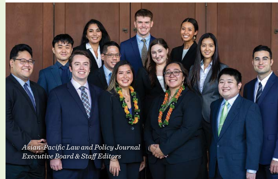
Asian-Pacific Law and Policy Journal Executive Board & Staff Editors